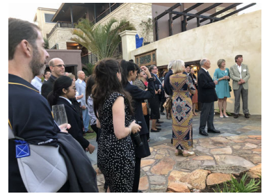
Some of the guests listening to speeches