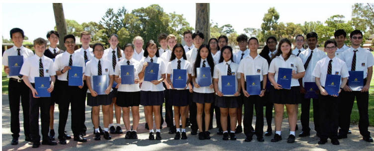
2019 Sphinx Foundation Scholarship recipients

The upper school awards were presented at an all-School assembly on 8 th Feb. The 29 awardees are pictured below.