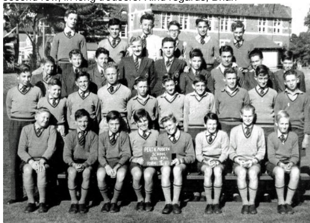
Perth Modern School 2D April 1954