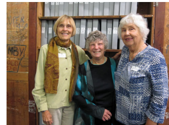
Recent visitors to the History Centre