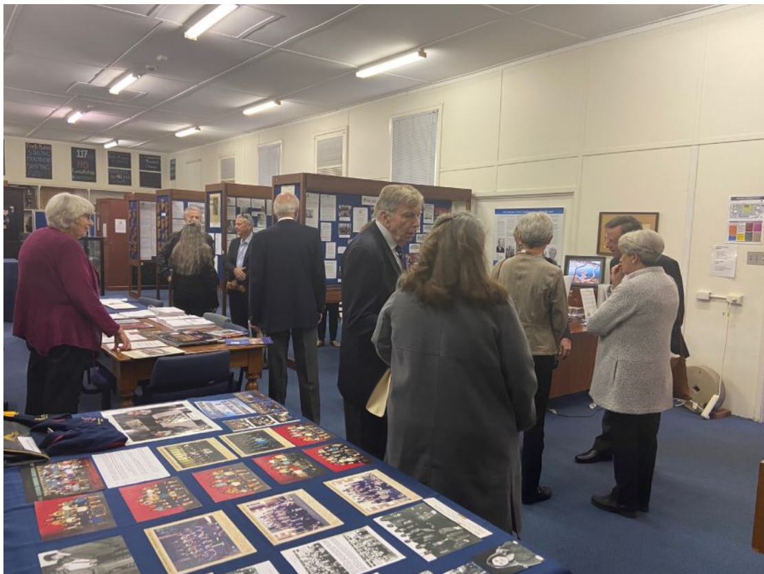
The Museum opened to all visitors attending the 2021 Annual Reunion