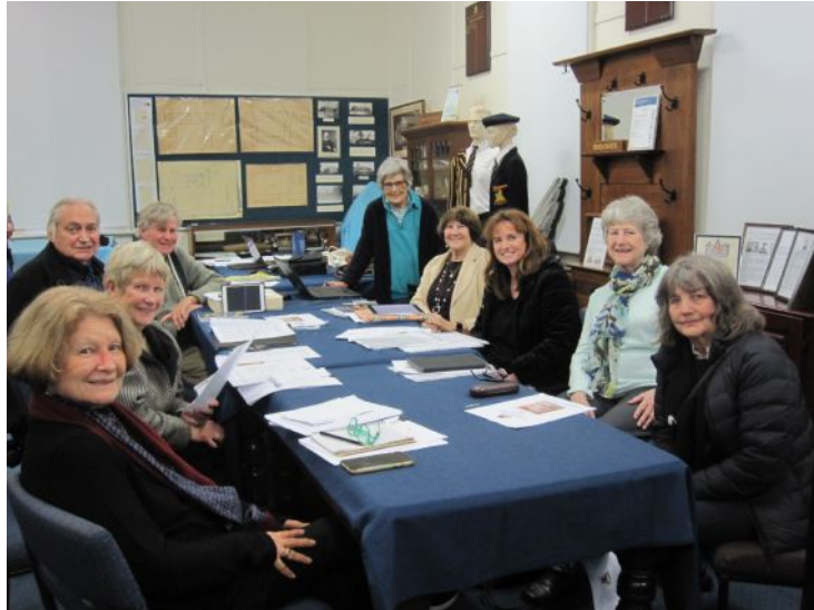
Museum Board Members met with Councillors on 2 nd August to present the 2020-21 Annual Report