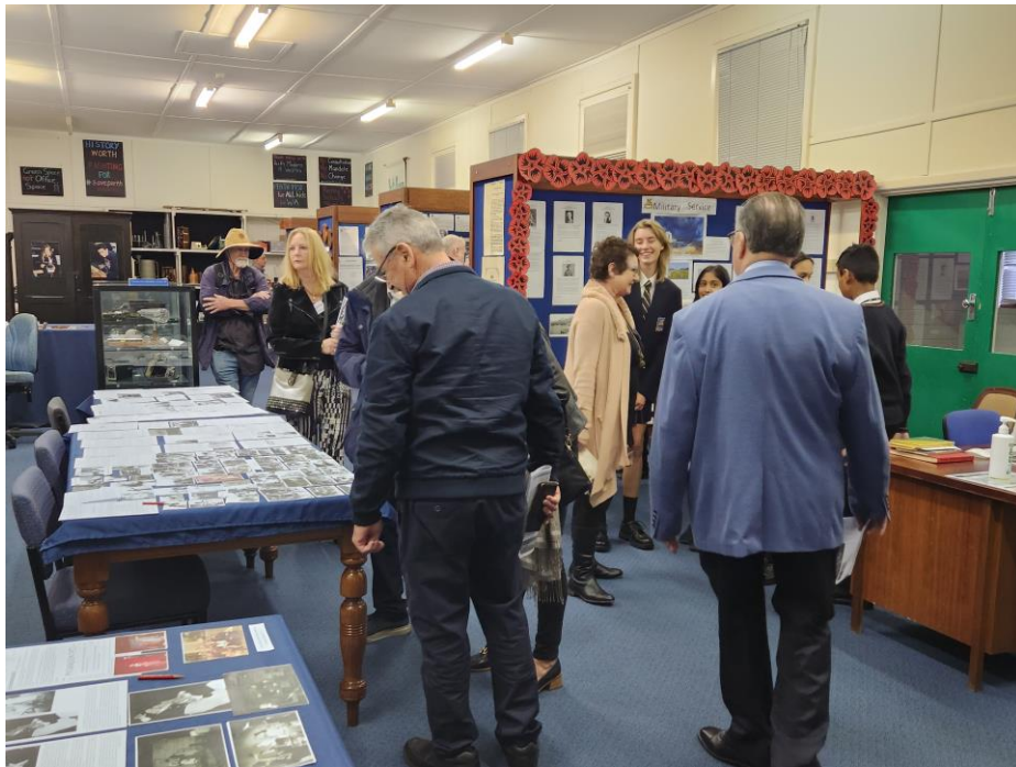
One of the many Museum open days which include reunions and events