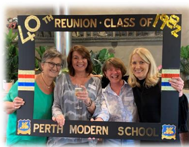
Class of 1982 – 40 year reunion