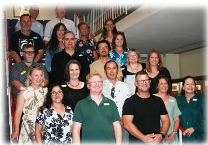
Class of 1992 – 30 year Reunion

The Annual Reunion for the Perth Modernian Society was held on 10 th September 2022. Following on from the very successful 2021 format, the Reunion comprised a wonderful final concert from the senior students leading to high tea. The Museum volunteers were especially pleased at the number of people visiting the Museum on the day.