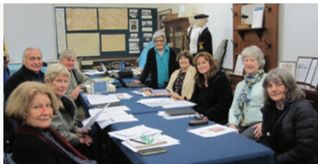
Photo: Elected Councillors joined members of the Board of the Perth Modernian Society Museum Association Incorporated on Monday 2 August 2021 to receive the 2020-2021 Annual Report on behalf of all members of the Perth Modernian Society Inc.

PERTH MODERNIAN SOCIETY MUSEUM ASSOCIATION INCORPORATED