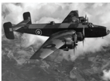
Halifax heavy bomber