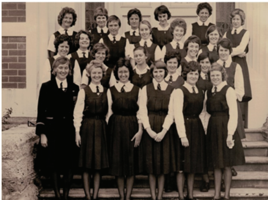
CLASS V3 (Yr 12) 1961