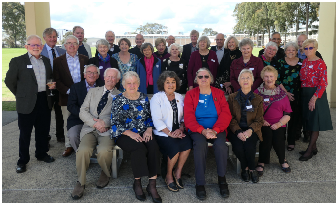
PMS 1958 class reunion - taken 11Sept. 2021