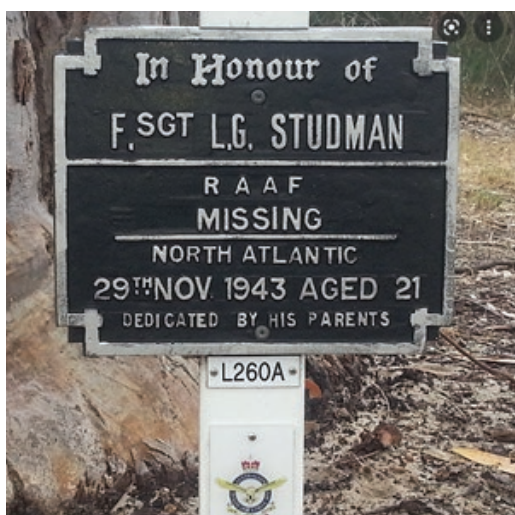
Kings Park Memorial Plaque