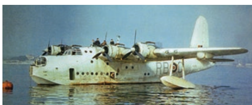
Sunderland Mark III