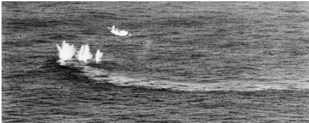
U-106 Under Attack

Leslie's 26th and last patrol departed from Pembroke Dock at 10:05am on 29 September 1943 and headed for the Bay of Biscay. A message "O-A", meaning "under attack", was received at Pembroke Dock at 2:10pm. Nothing further was heard from the crew and no survivors were found despite an extensive search.