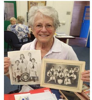
Peta with photos donated